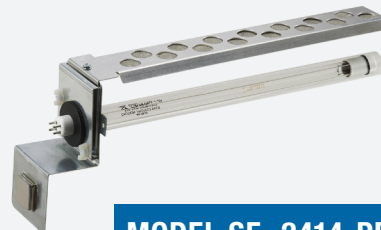
MODEL SF -2414-PREMIUM

Our standard system used for coil and surrounding air disinfection. Optional odor control lamp available for advanced purification.